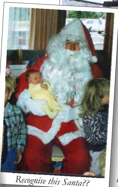
Recognise this Santa??