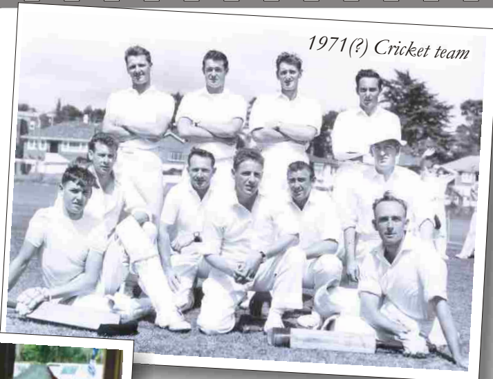
1971(?) Cricket team